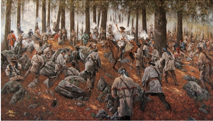
Patriots, Sycamore Shoals of Watauga